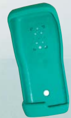
Rubber protective holster